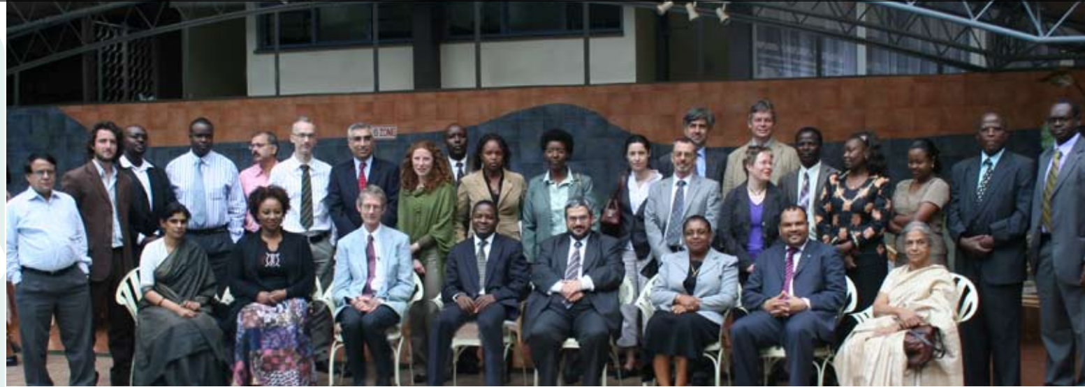
SET-DEV partners during a Steering Committee Workshop held in Nairobi, Kenya on 20th - 21st May, 2009

The African manifesto will be constructed through a series of activities between 11 key partners in the SET DEV project, in Africa, India and Europe. The process is funded by the European Commission through the Framework 7 Programme and under the call for “International Dialogue: Capacity Building in Developing Countries”. The entire process will culminate in the drafting of two manifestos - an African and an Indian manifesto and generate discussions around each of their constituent elements and the relationship between science ethics and socialization of science. Initially the manifesto was targeted specifically at two countries - India and Kenya, however a strong demand for an African Manifesto during the early stages of the project created a need for widening